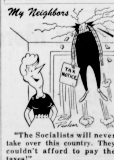
"The Socialists will never take over this country. They couldn't afford to pay the taxes!"

S & S EQUIPMENT CO. 117 No. Lane Phone 146