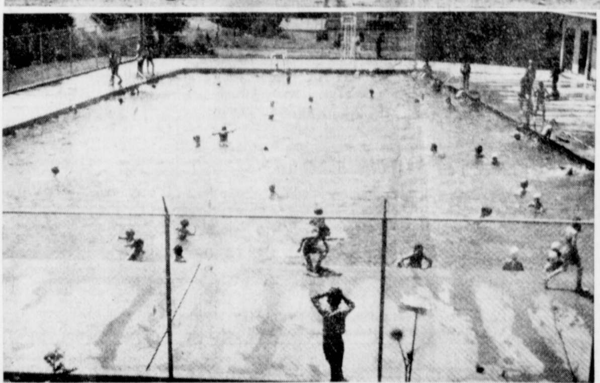
A LONG LINE OF ANXIOUS YOUNG SWIMMERS line up in front of the new South Lane Recreation Inc. swimming pool bathhouse before the opening of the pool Saturday. These are part of the comparatively few 176 children who attended first day swimming at the pool. In the bottom picture first day swimmers are shown frolicking in the water.