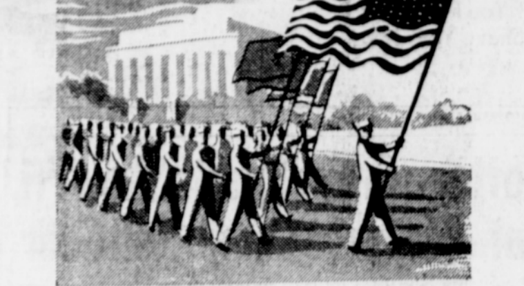
"The flag, when carried in a procession with another flag or flags, should be either on the marching right; that is, the flag's own right, or, if there is a line of other flags, in front of the center of that line. The flag should not be displayed on a float in a parade except from a staff, or so suspended that its folds fall as free as though the flag were staffed."

(Editor's note: This is one of a series of pictures illustrating flag etiquette, furnished by the Navy Recruiting Office in Eugene, and is presented in the Sentinel each week until Armed Forces Day, May 21.)