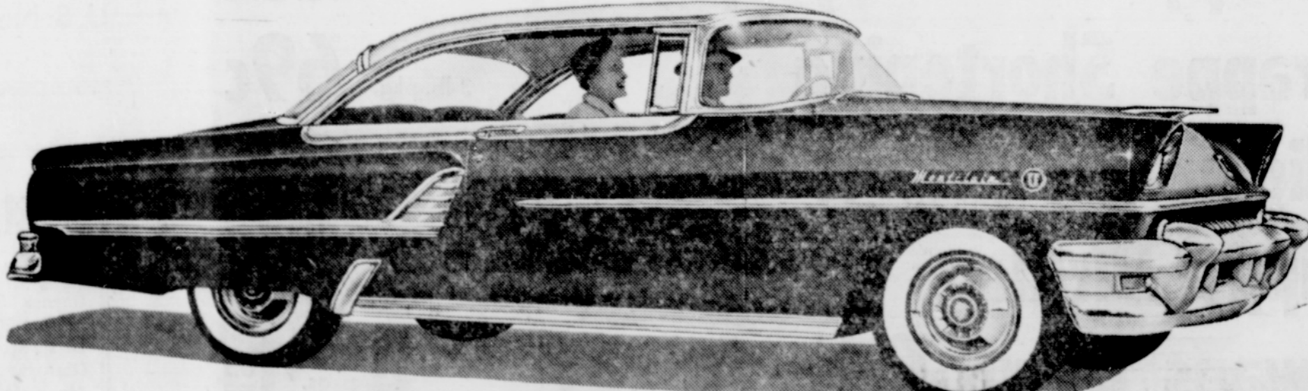
NEW 1955 MERCURYS offer high horsepower (188 and 198)—new SUPER-TORQUE V-8 design—for super-pickup in every speed range.

LONGER EXPERIENCE. Only Mercury among all cars has an exclusively V-8 history. New 188- and 198-hp SUPER-TORQUE V-8 engines are the latest and greatest Mercury developments. And Mercury has put over 2,000,000 proven V-8 engines on the road—more V-8's than any other car in its price class.