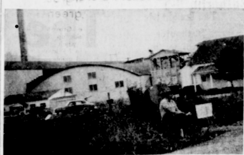
SOLE AFL PICKETER at Woodard Lumber Co. is Kenneth Freed, green chain worker. Freed makes $1.52 1/2 an hour and is among those workers demanding a 12 1/2 cent raise.