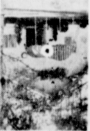
Mills Mortuary Established 1912 Washington at Seventh Phone 202 Cottage Grove, Oregon

Don't be a leaf. Sift and evaluate words; go against the wind, if your destination lies in that direction.