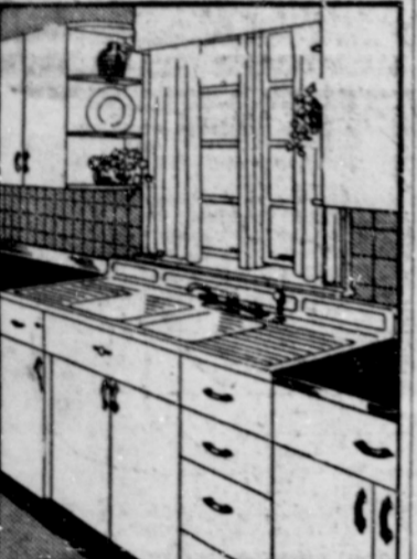
Make your kitchen modern and attractive with gleaming white Youngstown equipment.