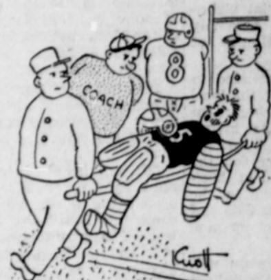
"I've decided to take up badminton instead."

Oregon State and Fresno State both came through playoffs last weekend in impressive style. The Beavers whipped the Trojans, 12-10, and 5-4, while the Bulldogs were whipping Seattle university, 2-1 and 20-4. Fresno State will come to Corvallis as the champion independent team of the west, with OSC representing the PCC.