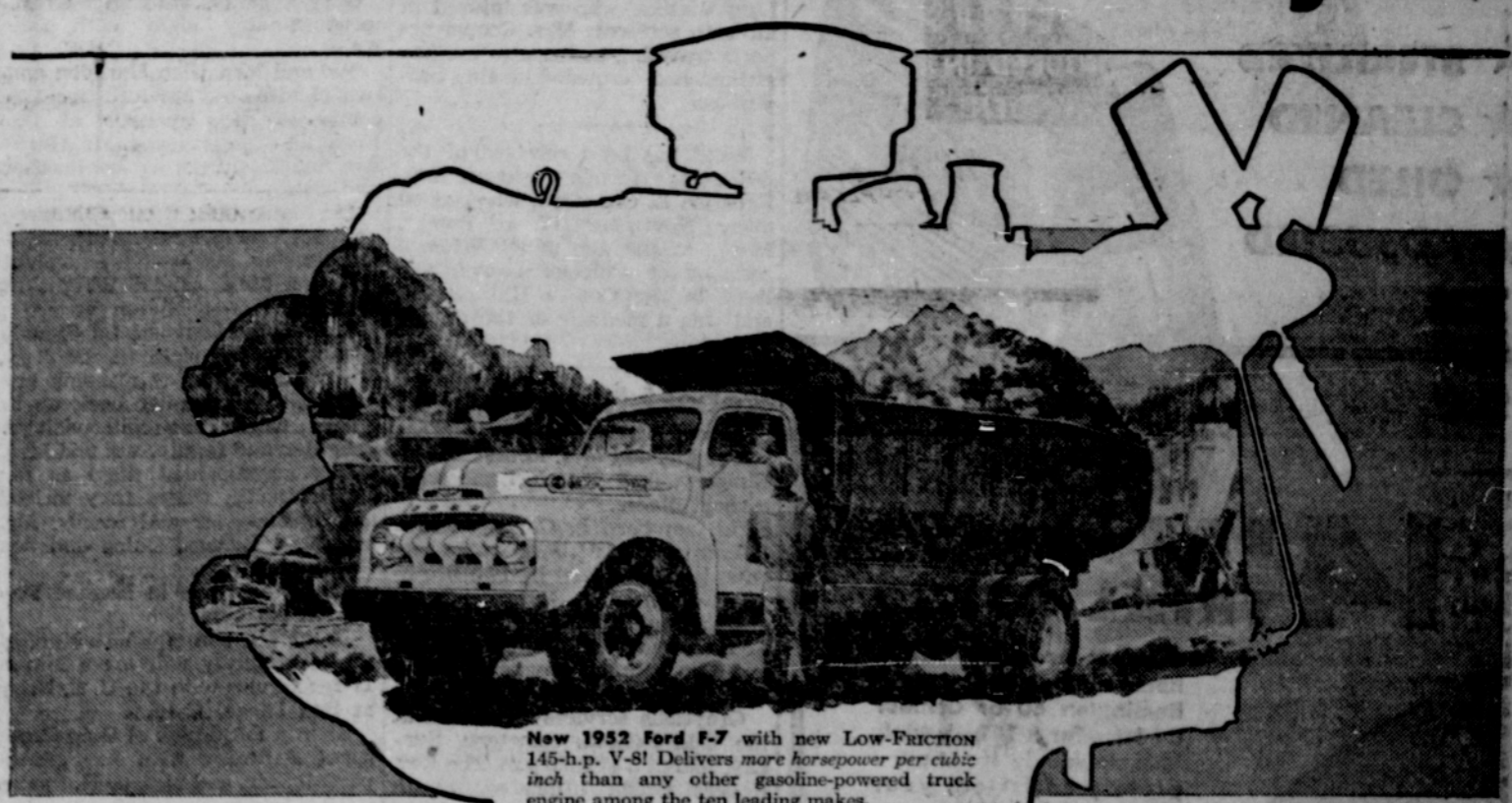
New 1952 Ford F-7 with new Low-Friction 145-h.p. V-8! Delivers more horsepower per cubic inch than any other gasoline-powered truck engine among the ten leading makes.