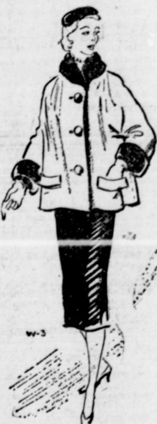
Red woolen coat.