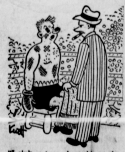
"I ain't so keen about this on-the-job training."

Blessed is the man who having nothing to say, abstains from giving us wordy evidence of the fact.