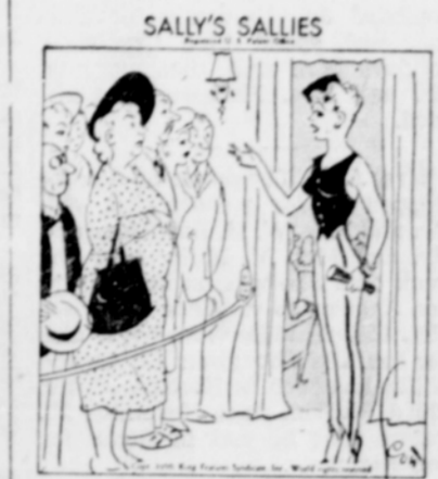
"There's only a single available and—my, how I wish I could take it myself!"

Phoenix Rainfall The yearly average rainfall in Phoenix, Arizona, is only 7.74 inches.