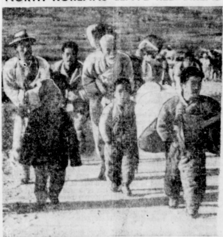
OLD MEN AND CHILDREN ALIKE join the trek of North Korean civilians fleeing the Chinese Red occupation. They follow in wake of withdrawing U.N. troops.