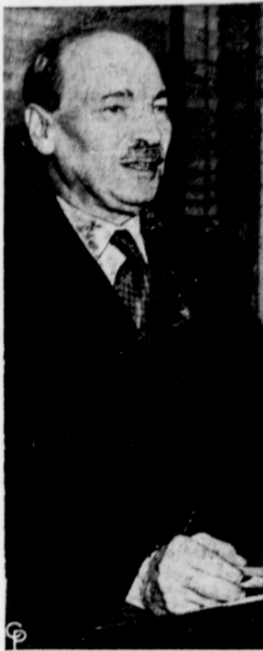
ADDRESSING the National Press Club in Washington, England's Prime Minister Clement Attlee declares that "Britain never will appease the Communists." He lashed out at critics of Gen. MacArthur praising his "resolute leadership." Attlee added that he and President Truman were reaching a complete understanding.