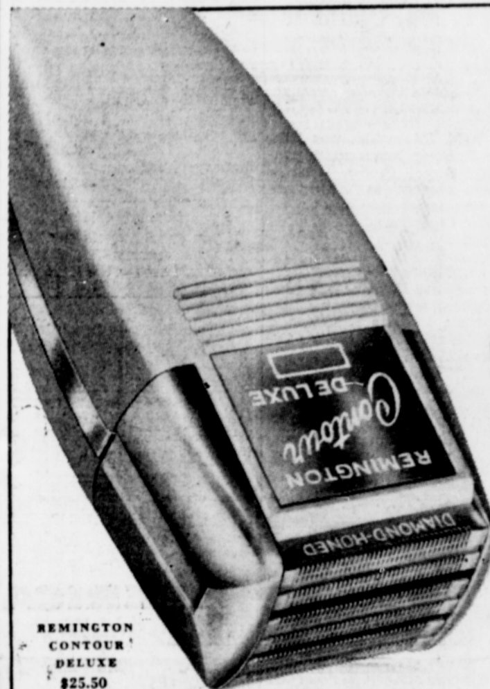
REMINGTON CONTOUR DELUXE $25.50

MR. DARRELL FRYE of Remington Rand Co. will be at our store these two days to completely service any make of electric shaver — at no charge except for parts. Only factory parts. If your old razor is too badly worn to give satisfaction we will allow you up to $7.50 for your old shaver.