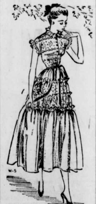
Embroidered organdie frock.