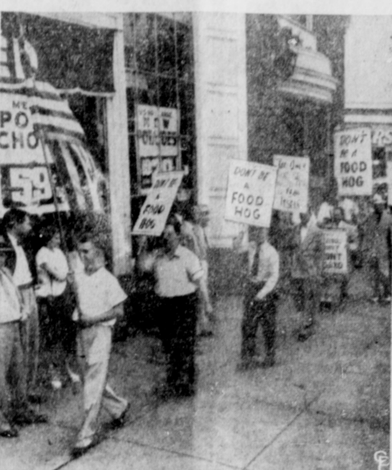
"DON'T BE A FOOD HOG," is the slogan on banners carried by C.I.O. pickets as they march in front of a Philadelphia grocery store. Similar protests, staged in many sections of the city, are intended for the hoarding customers, rather than the business men.