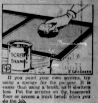
If you paint your own screens, try using a sponge for the purpose. It is easier than using a brush, as it splatters less. Put the screens on the basement floor or across a work bench when you do the job.