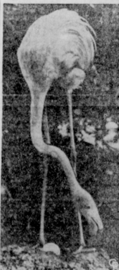
THIS LONG-LEGGED flamingo at the San Antonio, Tex., zoo has reason to be proud. She's keeping an alert eye on what is believed to be the first egg laid by a flamingo in captivity in the United States. Zoo custodians think it may also be the first in the world.