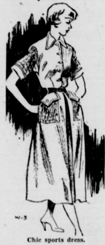
Chic sports dress.