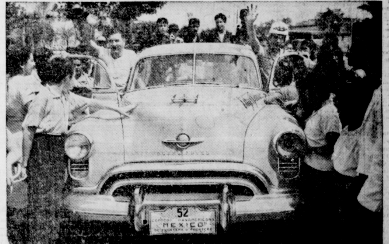
Hershel McGriff, Portland, Oregon, flashes a winning smile after piloting his '88' to victory! 132 American and foreign cars entered, but only 53 finished the rugged run. And three of the first ten and six of the first twenty were Oldsmobiles!

STOCK CAR OUTPERFORMS 131 OTHER CARS IN 2178-MILE PAN-AMERICAN ROAD TEST!