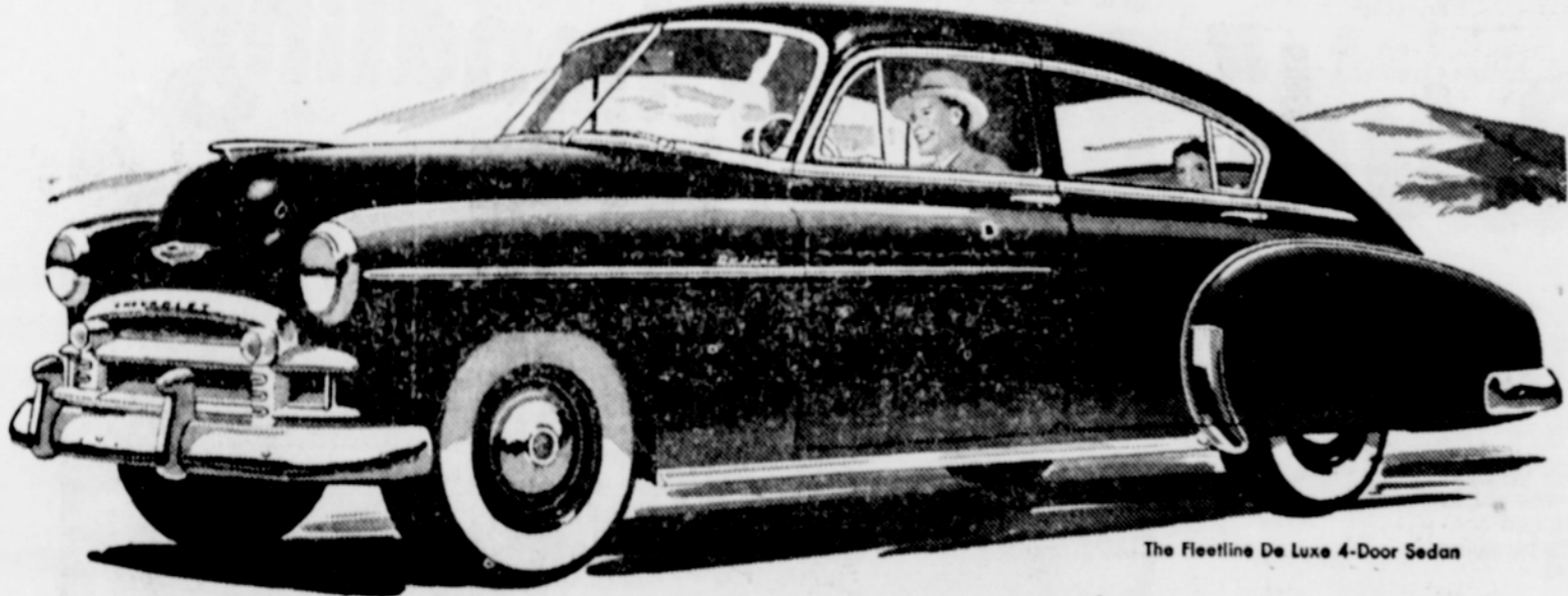
The Fleetline De Luxe 4-Door Sedan