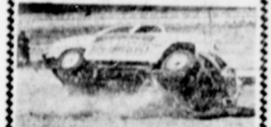
MILE A MINUTE LEAP FROG

The show you read about in LIFE, Time, Sat. Eve. Post and Fortune... you've seen them in movies and on TV! See them in person... see head-on crashes, leaps thru flames... the greatest thrill spectacle you have ever seen! DON'T MISS IT!