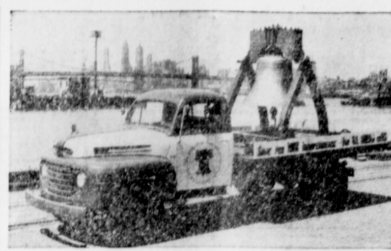
Trucks supplied by Ford Motor Company are carrying replicas of the famous Liberty bell into every state of the United States to spearhead the U. S. Treasury department's Savings Bond Independence Drive. The bells were given to the Treasury by six United States copper companies. When they arrived in New York they were mounted on Ford trucks and sent to every state in the Union. The above photo shows one of the bells mounted on a Ford truck at the Brooklyn Navy yard, with the New York City skyline in the background.

William Henry Harrison was president of the United States for only 31 days. He caught pneumonia during his inauguration and died April 4, 1841.