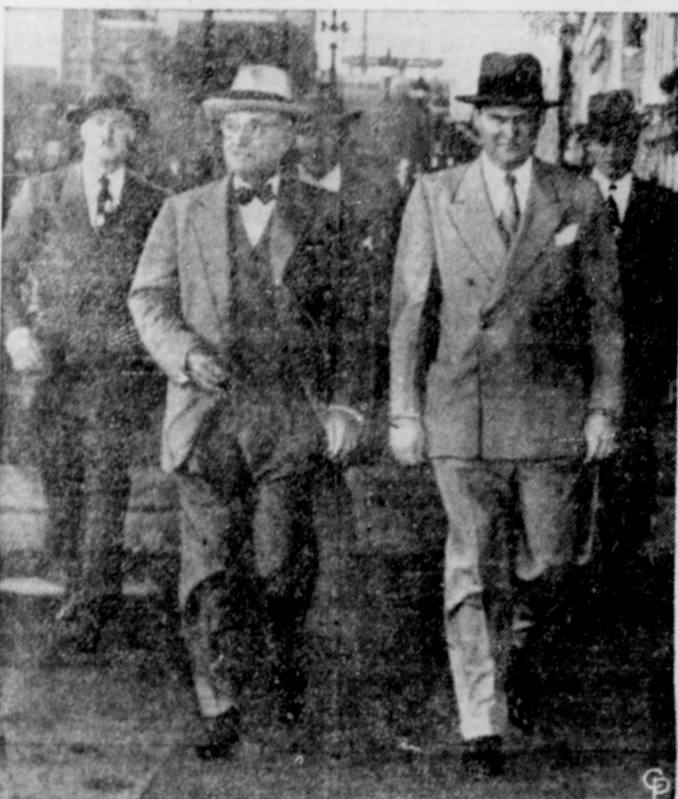
REACHING CHICAGO to play the leading role in the National Democratic Conference, President Truman takes his morning constitutional on Michigan Avenue. His major Stadium speech and a gala parade to the rostrum wound up the three-day Jefferson Jubilee.