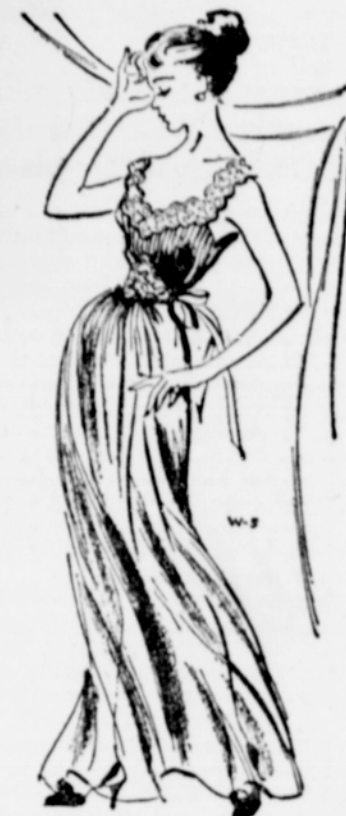
Dainty pink lingerie.