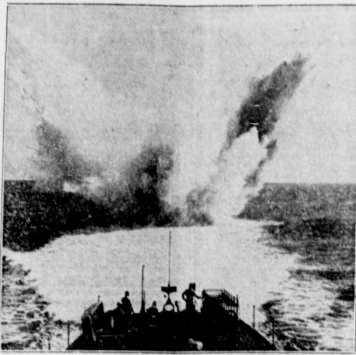
RESULT OF A DEPTH CHARGE —The mission of the Hunter-Killer Team of surface vessels, airplanes and blimps is to seek out and destroy enemy submarines. One depth charge explosive could seriously cripple a submarine. Here this phase of anti-submarine warfare is simulated in maneuvers in the Caribbean.