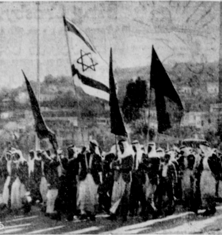
EN ROUTE TO A MEETING of the Palestine Labor League, Arab delegates, one carrying the flag of Israel, march through Nazareth. The Arabs represented 11,000 laborers in 34 towns. The League is a branch of the "Mapai", politically similar to British Labor party.

entitled "A Spiritual Stewardship Neglected." Of ancient Israel's apostasy we are told "The sorrow."