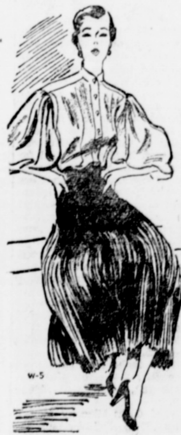
Blouse and skirt costume