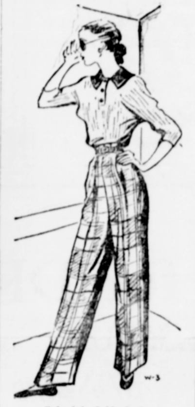
Colorful plaid slacks.