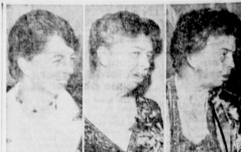
WHEN IT COMES to keeping abreast of events and feminine fashions, Mrs. Eleanor Roosevelt is one person who is not to be caught napping—even if it does get in her hair at times. Pictured left, the former First Lady is shown in October, 1934; wearing a pompadour effect (center) in March, 1948, and as a United Nations delegate in September, 1949, wearing her latest coiffure, the "Mary Martin" hairdo.