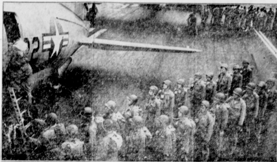
MARINES MOVE RESERVES BY AIR —Using airlift this year for the first time to fly Marine Corps Reservists to and from summer training camps, the Marines had flown 3,500 "Citizen Marines" nearly 4,000,000 passenger miles without untoward incident by the first week in July. Above, members of the Fifth 105-MM Howitzer Battalion prepare to return by air to Kansas City, Missouri, from the Marine Corps Air Station at Quantico, Virginia, where the unit completed two weeks of active training.