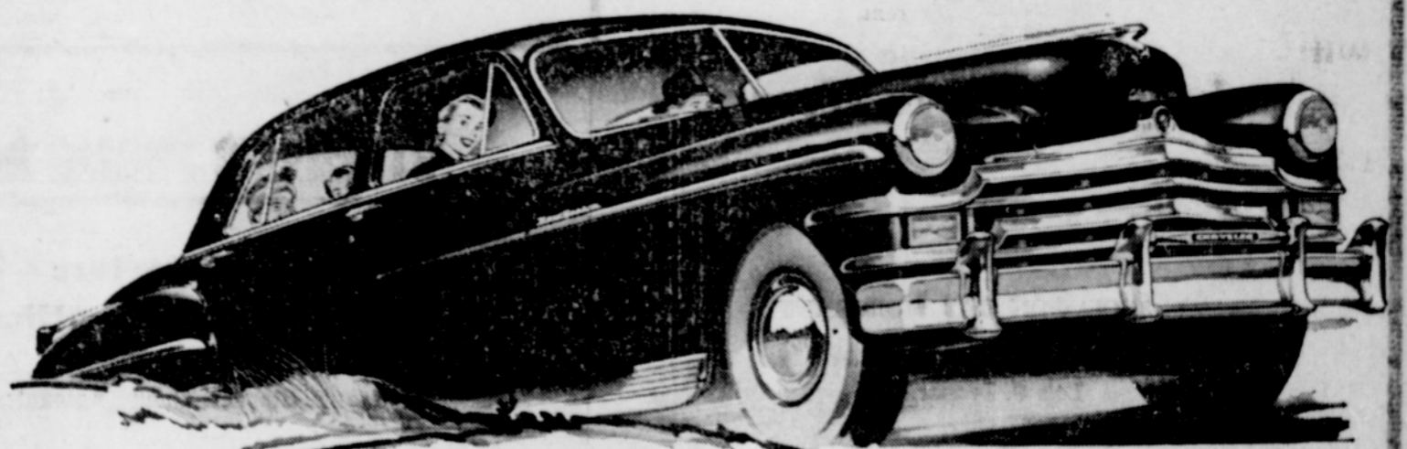
NEW YORKER 4-DOOR SEDAN