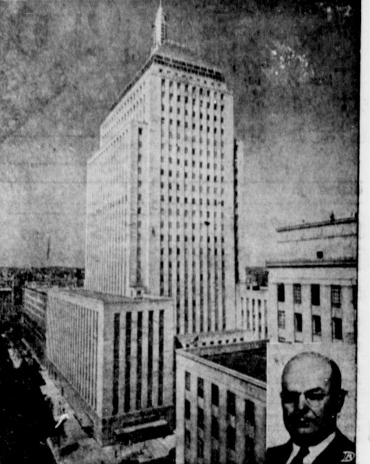
BOSTON—Tallest building on eastern seaboard between New York and Canada, John Hancock Mutual Life Insurance Company's new 26-story home office building was opened officially with Secretary of the Treasury John W. Snyder, inset, as principal speaker. This is first photo of recently completed structure minus scaffolding.