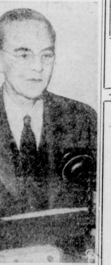
Sir Stafford Cripps

SPEAKING over the radio from London, Sir Stafford Cripps, Britain's Chancellor of the Exchequer, announces the devaluation of the pound sterling from $4.03 to a new low of $2.50. Many other nations immediately cut their own currencies.