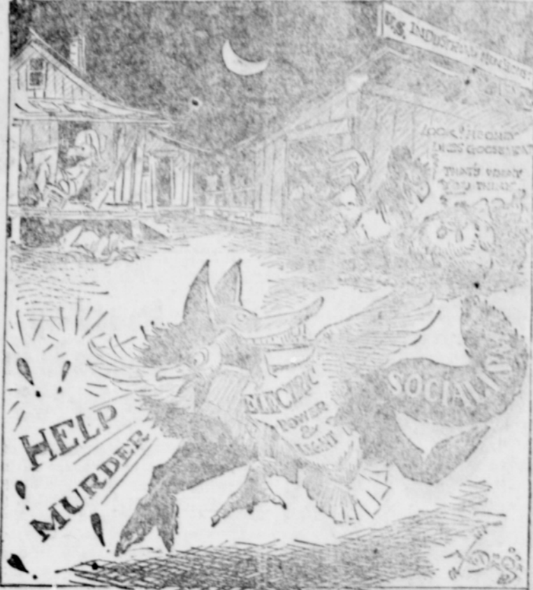
Give Him a Little Time and the Socialist Fox Will Get the Rest, Too