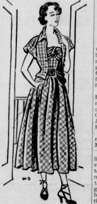
Pink and black resort dress.

By VERA WINSTON PINK AND BLACK checked sheer cotton is the timely choice for a nice day-into-evening dress and jacket for informal summer wear. The frock has a strapless top with crossed-over draped bustline. The skirt is gathered all around. The black velvet belt has a swashbuckle flared end. The tiny jacket is lined in black and has cap sleeves. It closes with three black buttons. This is a good little resort number too.