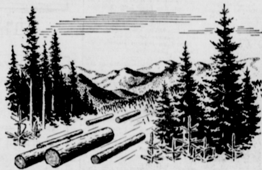
-AN ENDLESS SUPPLY OF LOGS FROM TREE FARMS.