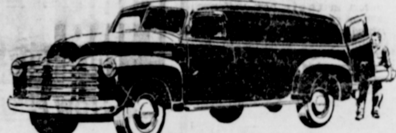
MEDIUM-DUTY PANEL Model 3805—137-inch wheelbase, Maximum G.V.W. 6700 lb. Also available in light-duty Model 3105—116-inch wheelbase, Maximum G.V.W. 4600 lb.