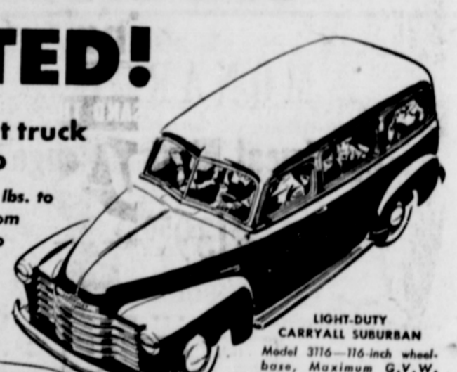
LIGHT-DUTY CARRYALL SUBURBAN Model 3116—116-inch wheelbase, Maximum G.V.W. 4600 lb.

There's a Chevrolet truck for every job with capacities from 4,000 lbs. to 16,000 lbs. G.V.W.—from smart delivery units to massive heavy-duty models.