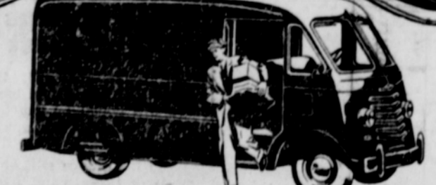
FORWARD-CONTROL CHASSIS Model 3742—125 1/4 inch wheelbase, Maximum G.V.W. 7000 lb. Also available in Model 3942—137-inch wheelbase, Maximum G.V.W. 10,000 lb. Package Delivery Type Bodies suitable for mounting on the Forward-Control Chassis are supplied by many reputable manufacturers.

There's a Chevrolet truck for every job with capacities from 4,000 lbs. to 16,000 lbs. G.V.W.—from smart delivery units to massive heavy-duty models.