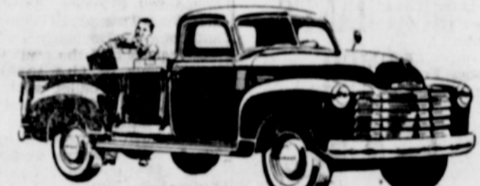
MEDIUM-DUTY PICKUP Model 3604—125 1/4 inch wheelbase, Maximum G.V.W. 5800 lb. Other models available: 3804—137 inch wheelbase, Maximum G.V.W. 6700 lb.; 3104—116 inch wheelbase, Maximum G.V.W. 4600 lb.