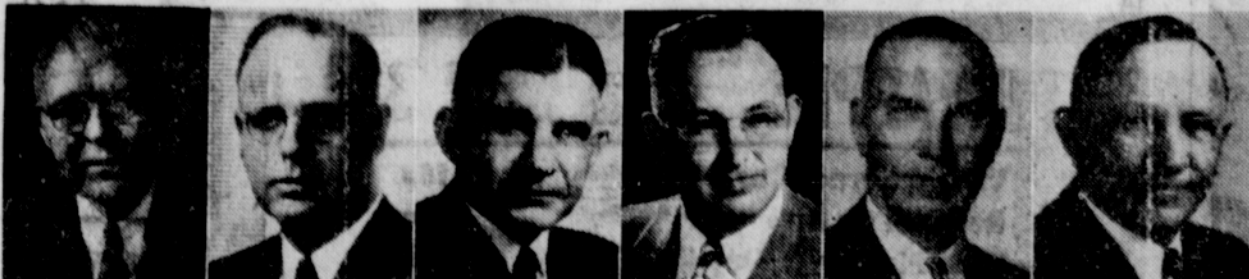
HOMER D. ANGELL Congressman (third district) HARRIS ELLSWORTH Congressman (fourth district) DOUGLAS MCKAY Governor EARL T. NEWBRY Secretary of State HOWARD C. BELTON State Treasurer GEORGE NEUNER Attorney-General