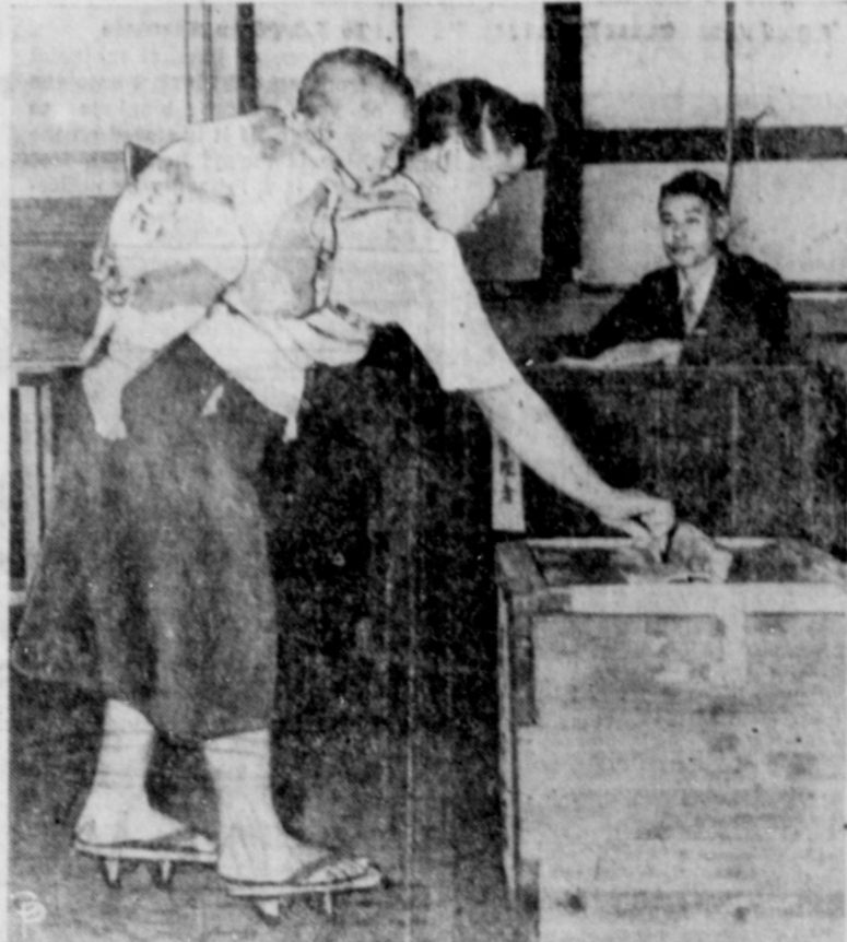
BALANCING HERSELF on her odd-shaped wooden clogs, a Japanese mother leans over to deposit her ballot in the school board elections of the Minato-ku section of Tokyo. This type of wooden sandal has become commonplace in Japan due to a shortage of leather. (International)