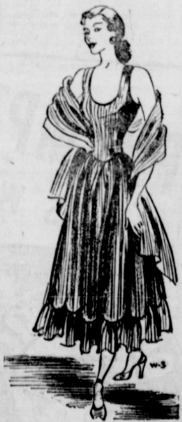
Basque dress and matching stole.