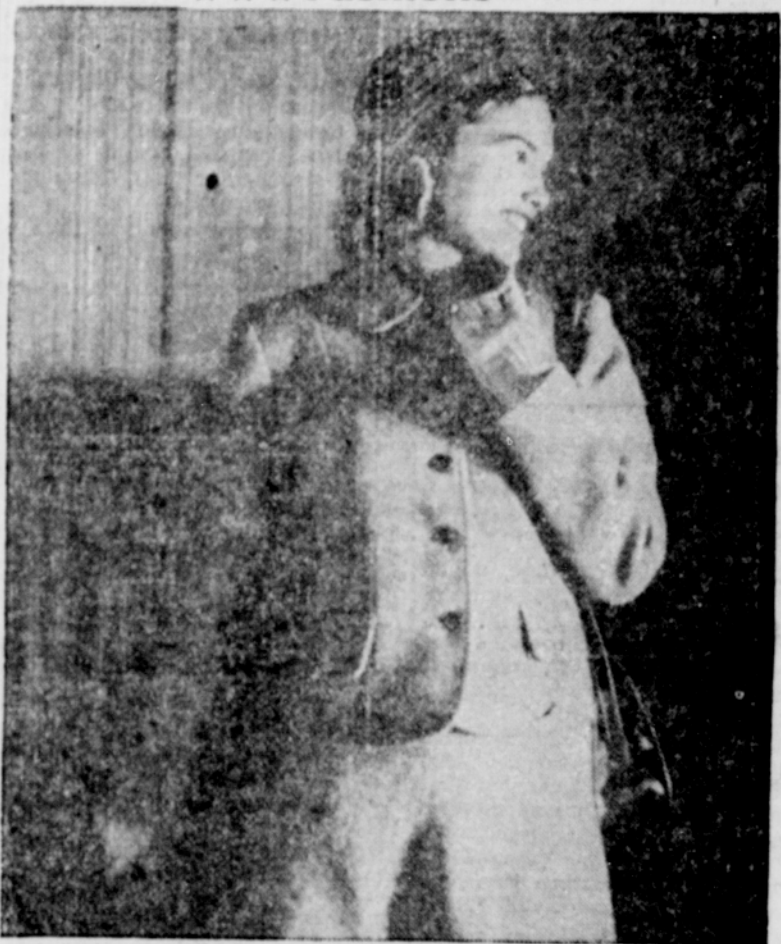
Today's teen agers insist that the new fashions make sense, and the new clothes are making a bit because they are not corny. Shown above as pictured in the August issue of Good Housekeeping magazine is "the easiest tweed suit in the world," cut for fast traveling between soda fountain and study hall.