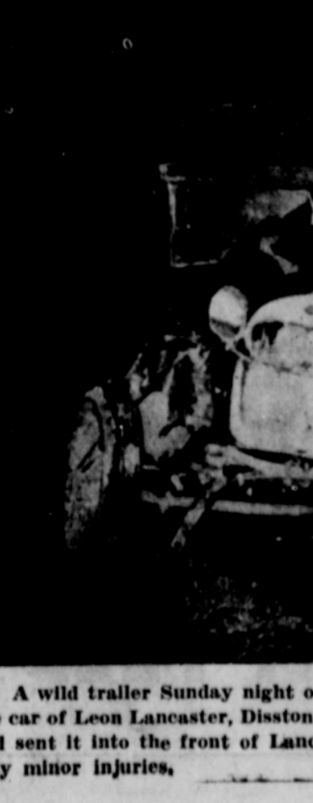
A wild trailer Sunday night on Mosby Creek highway demolished the car of Leon Lancaster, Disston, when the hitch on the trailer broke and sent it into the front of Lancaster's car. Lancaster escaped with only minor injuries.