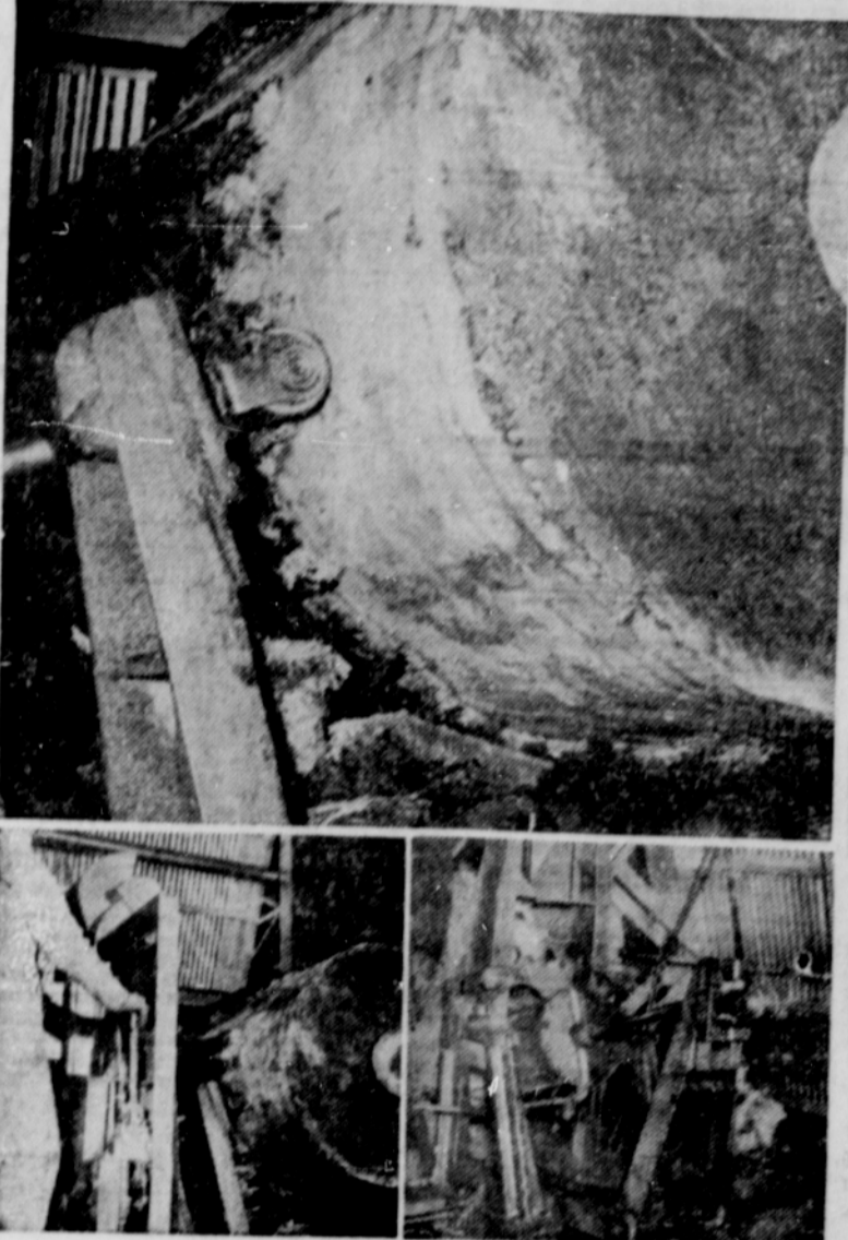
Above—New log de-barking equipment developed by the Weyerhaeuser Timber Company removes bark without crushing or splintering the log. A rotating head on a piston connected to an air cylinder squeezes bark from the log. Left—Here's the equipment at work. This process, besides saving 5% of the log formerly lost by conventional bark-removing methods, gives wood-fres bark for manufacture of Silvaco, a new raw material for use in plastics also developed by Weyerhaeuser. Right—Close-up of shearing head, piston and cylinder.

This is the act that will cook his royal Goose.