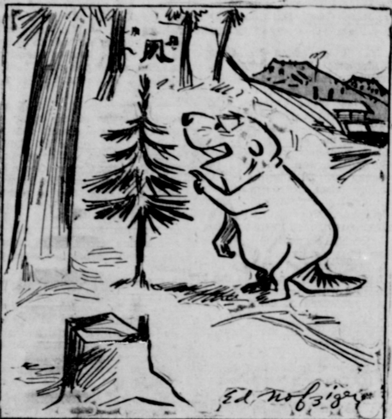
"God made you, little tree, but if you reach maturity under our present destructive cutting practices, it'll be a miracle!"