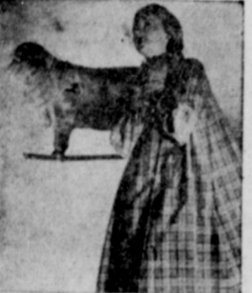
Color to offset the drabness of a rainy day is afforded in the plaid raincoat, new full swing back, with buttoned cuffs, shown above as pictured in the November issue of Good Housekeeping magazine.