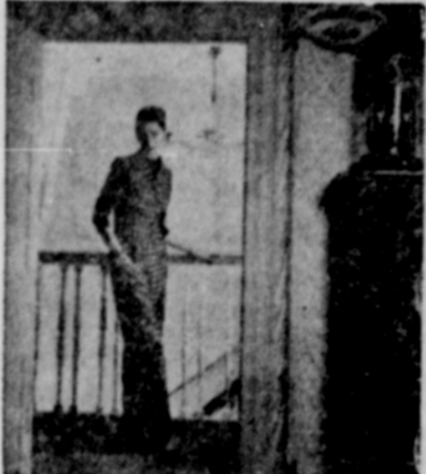
For outdoor or indoor wear the plaid wool slacks and vest in red, gray, gold and rust, shown above as pictured in the November issue of Good Housekeeping magazine, make attractive attire.