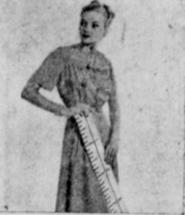
Short women will find that the button-front rayon dress with lace braid on the yoke, shown above as pictured in the November issue of Good Housekeeping magazine, will give them a trim appearance.