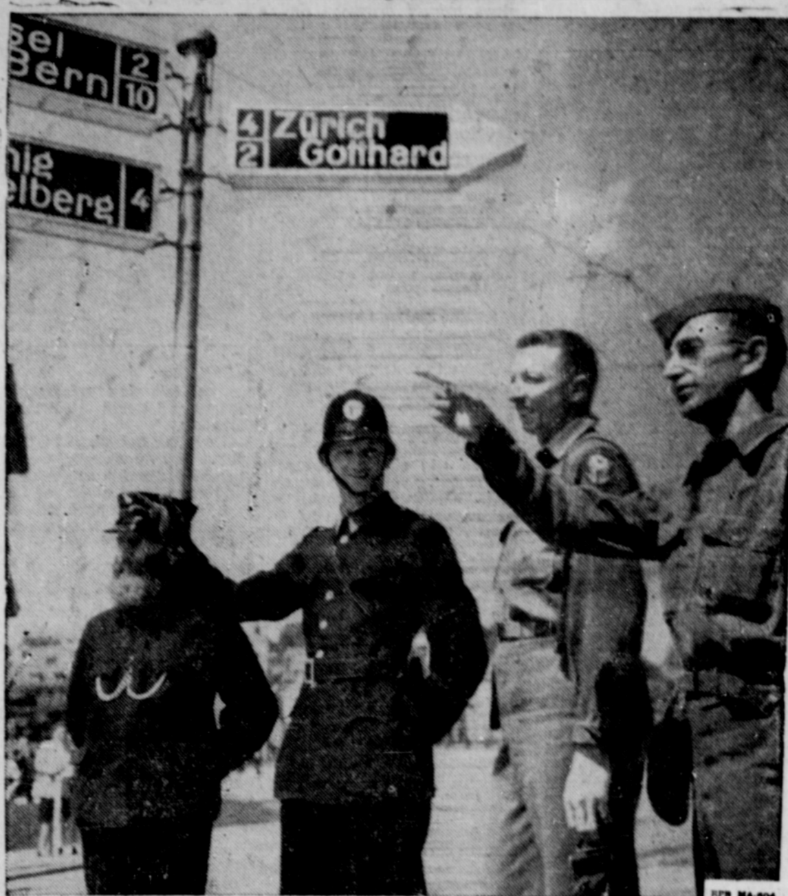
It wasn't so difficult asking directions in Lucerne, Switzerland, as was anticipated by these Army Regulars, on pass from their occupation duties in Germany, because they learned that most Swiss people speak English. For young men between 18 and 34 years of age, inclusive, who seek travel, adventure, recreation, and comradeship, the Regular Army offers many inducements.