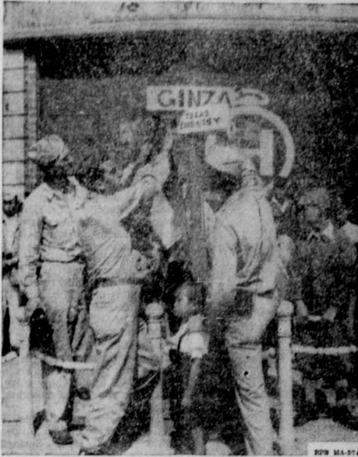
Always good for a laugh are road markers such as these, which our Regulars often set up in foreign countries. The three Texans above have outdone themselves in loyalty to their home state. A sense of humor, and the ability to make friends is an important attribute of a "Guardian of Victory."