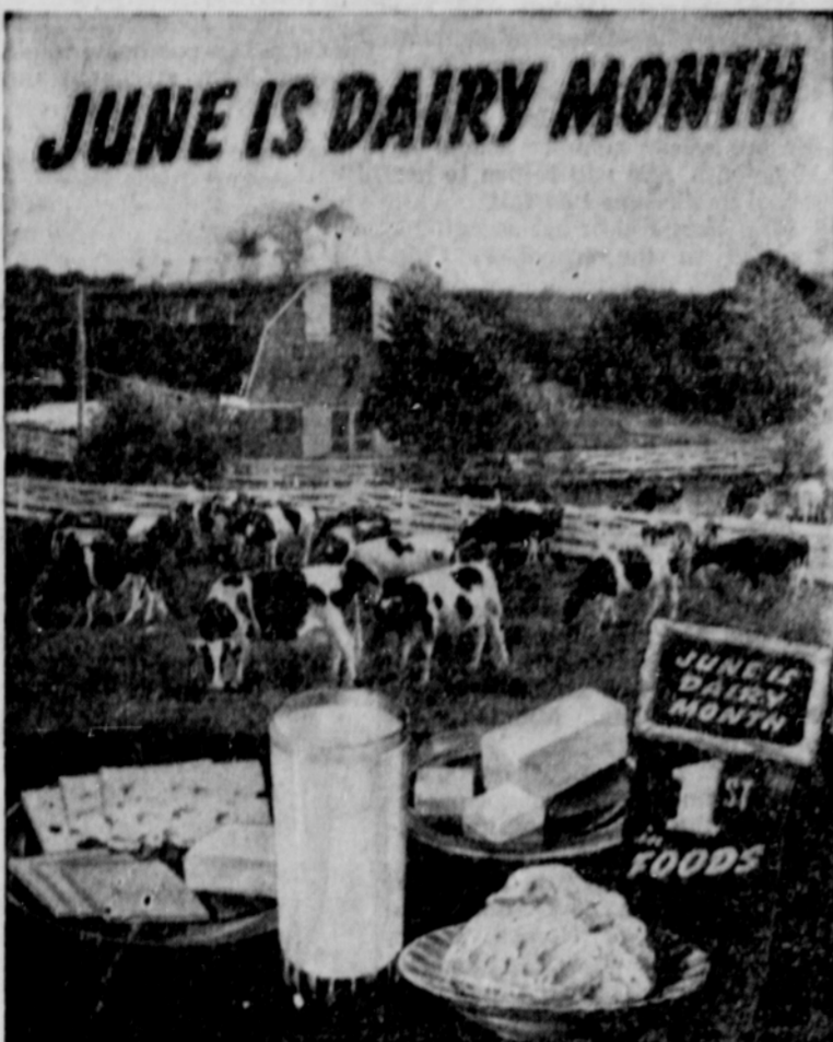
Emblematic of peace in a peace loving nation, and quietly reminding that dairying is America's greatest industry, the poster pictured above has been chosen as the symbol of June DAIRY MONTH for 1946. It's a familiar scene, as American as the Stars and Stripes. A herd of cows, peacefully grazing over green fields, cows that never heard the roar of hostile guns, that never saw the ravages of war. Such a scene, somehow, symbolizes the American love of peace, home, and good eating.

Sweet Corn —Plant in block plantings up to middle of June.