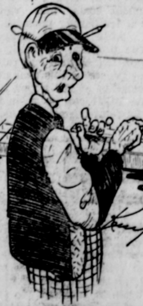
"This next stickful o' type is goin' to say just one thing—We got 35 millions of Japs to beat."