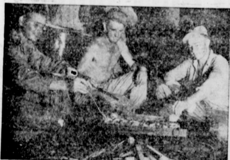
One of the most popular spare time diversions of Marines on Guadalcanal today is fishing, usually followed by a fish fry, shown above. Smoke gets in the eyes of three volunteer cooks who are preparing fish filets over a wood fire.