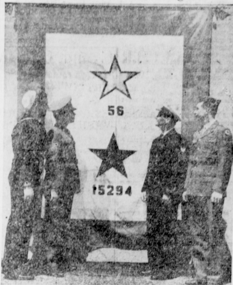
Representative of the more than 15,000 Southern Pacific employes now in the armed forces on battlefronts and in training areas, these furloughed railroaders posed with their company's Service Flag at recent observance of "S.P. War Service Day." Numerous rallies were held by the railroad's 100,000 men and women to honor their fellow workers in uniform and pay homage to the 56 who are officially reported as having died in the service of their country.