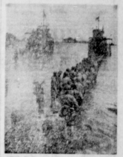
Soldiers in jungle camouflage passing ammunition from a navy infantry landing vessel in the South Pacific.