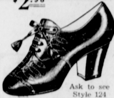
Ask to see Style 124 as sketched