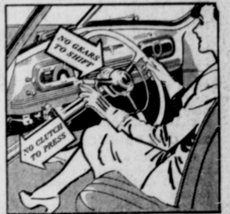
*Hydra-Matic Drive Optional at Extra Cost on All Oldsmobile Models for 1941

No doubt about it, Hydra-Matic's the coming way to drive—come in and try it!